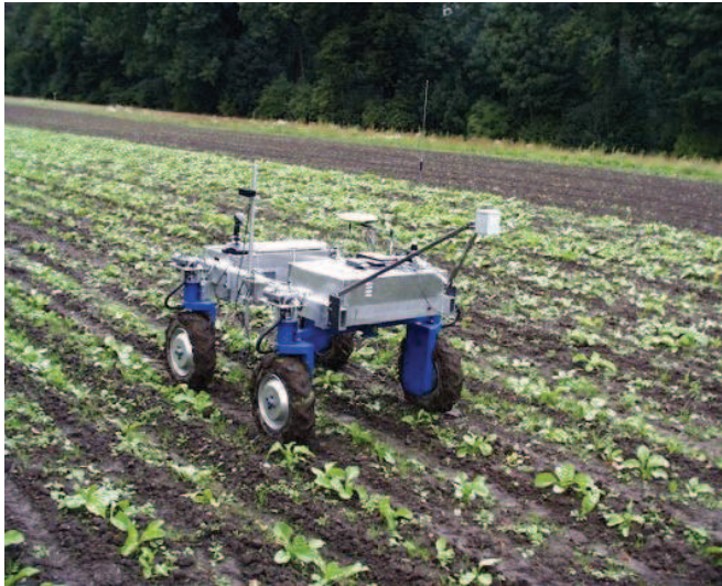
Fig. 3. The API platform.

In this scenario, the area for field scouting and weed mapping is limited to 500 ha to match large production units with the necessary flexibility. We have focused on cereal crops but it may also be relevant for other crops such as high value crops like sugar beet, potatoes or other horticultural crops. However, the shorter the time for carrying out the activity, the lower the overall capacity required.