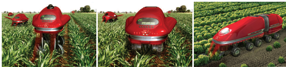
Fig 1. MF-Scamp robots for scouting, weeding and harvesting (Designed by Blackmore. Copyright©2008 AGCO Ltd)

efficient to replace the traditional large tractors. These vehicles should be able to carry out useful tasks all year round, unattended and able to behave sensibly in a semi-natural environment over long periods of time. The small vehicles may also have less environmental impact replacing the over-application of chemicals and fertilizers, requiring lower usage of energy with better control matched to requirements, as well as causing less soil compaction due to lighter weight.